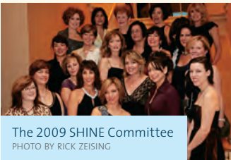
The 2009 SHINE Committee